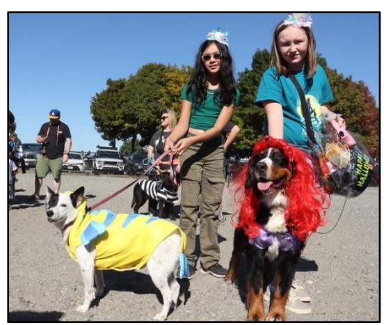
Little Mermaid and Flounder

We wish to thank Animal Control for attending and showing off their new truck. We also which to thank the following vendors and donors that helped make this day a great success! So, thank you: Dog's Best Friend; Howling Mad Creations; Kool Kidz Ice Cream Truck; McDonald McGarry Insurance Brokers of Edmonds; Gallaghers' Where-U-Brew; Blue Collar Dog House; Waterfront Coffee; Walnut Coffee; Rory's; Trader Joe's; Walnut Coffee; and Village Transmission.